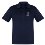
McCammon - Short Sleeve Polo

We are asking that our students wear a McCammon uniform top that displays the McCammon logo. This can be a uniform t-shirt, polo or hoodie. For bottoms, students can wear personal bottoms that are appropriate for a school setting. Details about ordering uniforms can be found on our school website through this link .